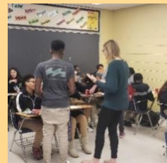
CCMA AmeriCorps VISTA volunteers and Parkdale High Students